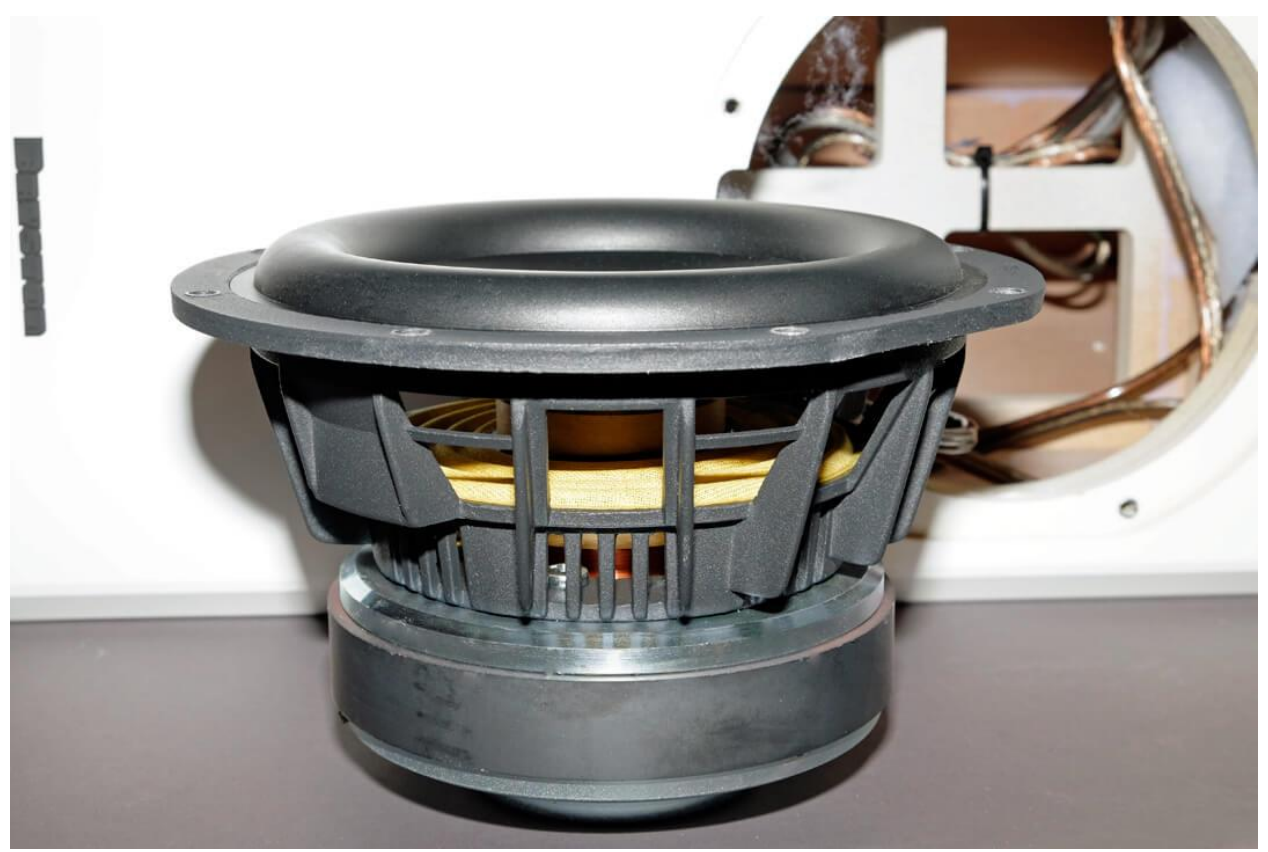
8 INCH WOOFERS IN BRYSTON MIDDLE T

after about one third of their depth. The width (27 centimeters) is measured that the two 8-inch woofers with their laterally flattened baskets have just enough space. This is followed by a 5.25-inch midrange and a 1-inch tweeter made of titanium. In the midrange and woofers, the membranes are made of aluminum with a ceramic coating. Separates at 160 and 2300 Hertz. Thus, the woofers with their impressive long-stroke surrounds, which are supported by two rear, flow-optimized shaped bass reflex ports, mainly function as a subwoofer.